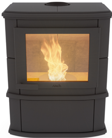
Grande Nobles Pellet